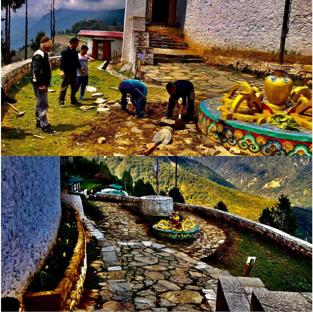
Making Dolep footpath