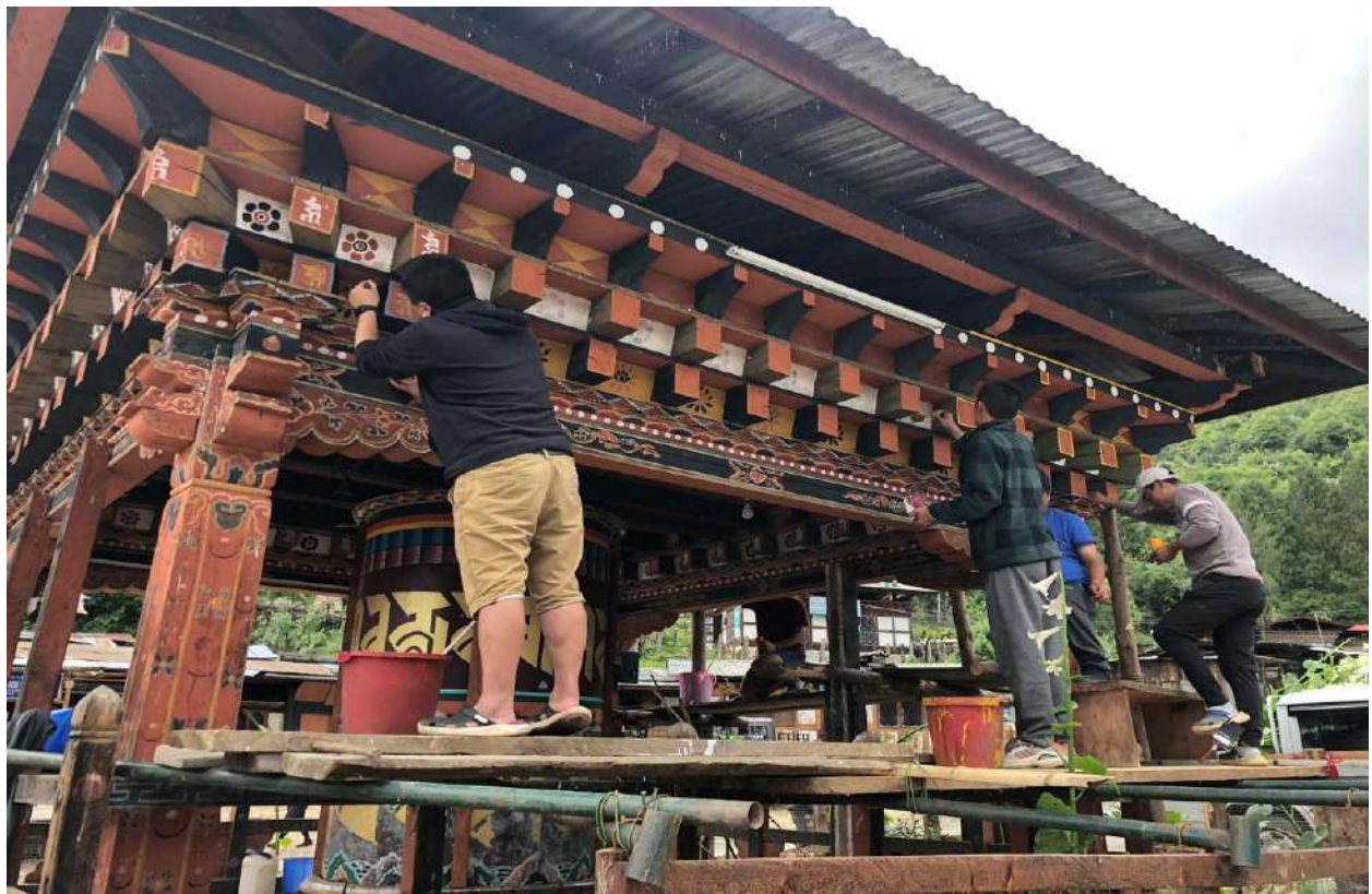
*Volunteer painting works by regional financial institution and few school teacher