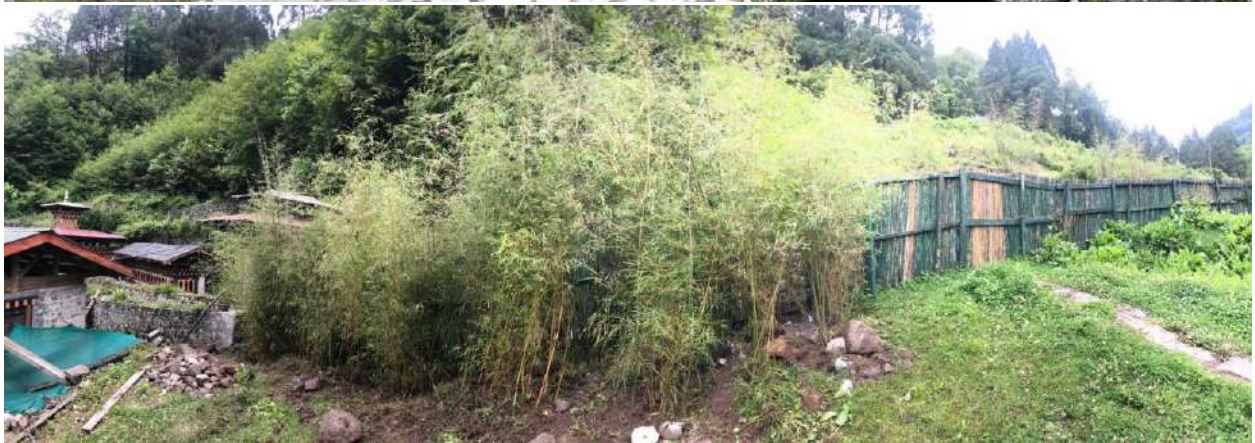
*Wild bamboo walling along the royal footpath.