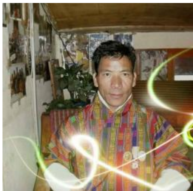
(གཟི་མི་ རྫོང་དབང་གྲགས་) རྫོང་ཁག་སྟེང་འཛིན་སྡེ་ཆེན་པོ།

གོ་ནང་ལུ་དུས་བཟང་ཁྱད་པར་ཅན་ ཆོས་༥,༡༠,༡༥,༢༥,༣༠ ཡོད་པའི་ནང་ལས་ ཡོངས་སྒྲགས་ལུ་ ཡར་སྤེའི་ ཆོས་༥,༡༠,༡༥, བཅི་སྟོན་ཡོད་པ་ཀུན་གྱི་མཁུན་གསལ་ཆེ་ འདི་གི་ཡང་མ་དོ་བ་ རང་བླ་དང་པ་ཆོས་འཕྲུལ་གྱི་ དུས་ཆེན་ལྷོ་དོ་གཅིག་ གསུམ་པའི་ཆོས་༡༠ ལུ་ཉམས་བྱུང་སྒྲུ་མཆོད་ བཞི་པ་ས་ག་ལྷ་བའི་དུས་ཆེན་ལྷོ་དོ་གཅིག་ ལུ་པའི་ཆོས་༡༠ ལུ་གུར་རིན་པོ་ཆེའི་འཁྱུངས་དཀར་དུས་ཆེན་ རྟག་པའི་ཆོས་༩ ལུ་ གདན་བཞི་ཆོས་འཁོར་སྒྲོར་ བའི་དུས་ཆེན་ཟེར་ ཡོ་གཅིག་ནང་ལུ་ དུས་ཆེན་ཁྱད་པར་ཅན་ བཅི་སྟུང་ཁྱེ་ཡོད་པ་འདི་ནང་ཀུན་གྱི་སྤྲིག་པའི་ལུ་ལུ་ འཛོམས་ཏེ་དགེ་བ་བླང་དགོ་པའི་གསོལ་འདེབས་ཞུས་ཡིན་ལགས།