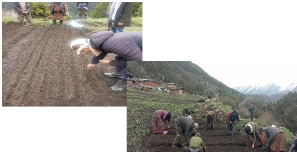
Figure 2. Demonstration on quinoa seed sowing at Wachey village

The crop is currently performing well and expected to harvest in a month or so. Thereafter, the sector will assess the yield and recommend for its cultivation at high altitude. The sector is also planning to introduce sunken bed vegetable cultivation to produce winter vegetables for highlanders.