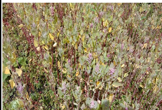
Figure 3. Grain formation maturing stage of the crop

Contributed by: Yonten Puntsho Lunana Agriculture Extension Supervisor