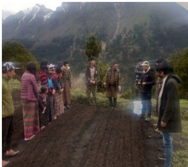
Quinoa for highlander

"The gewog is considered as one of the remotest in this Dzongkhag. It is sparsely located in the extreme northwest part of Dzongkhag and it consist of five chiwogs with 190 households with the population of over one thousand"