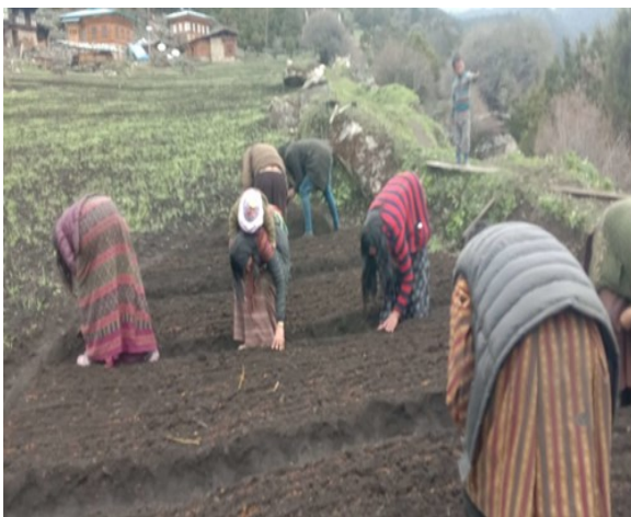
Figure 1. Demonstration on seed sowing

In collaboration with Agriculture Research Development Center, Bajo and Agriculture Sector of this Dzongkhag have conducted similar demonstration and trails on same crop at Lunana gewog.