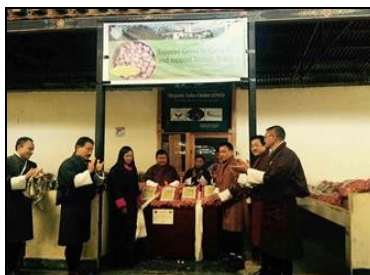
Launching of certified organic potatoes at CFM

On September 29, 2016, this Dzongkhag also signed Membership Memorandum of Commitment and became a new member of Asian Local Governments for Organic Agriculture (ALGOA) in South Korea by signing between the President of IFOAM Asia and Dzongrab Gasa Dzongkhag. Under the purview of this signing, Dzongkhag remains committed to work closely with other ALGOA member countries for the development of organic agriculture and its related industries in the coming years .