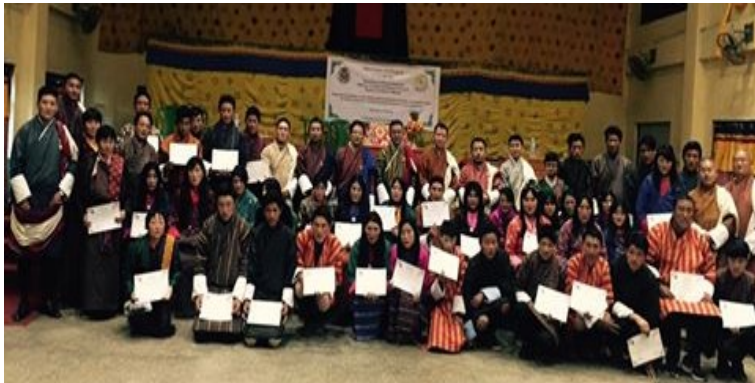
Participants with training certificate

These unbelievable new skills are but gifts of golden solution from the Golden Throne to address Lunaps' total dependency for these skills on outsiders. Otherwise Lunaps did not have a single person skilled in the above skills arts.