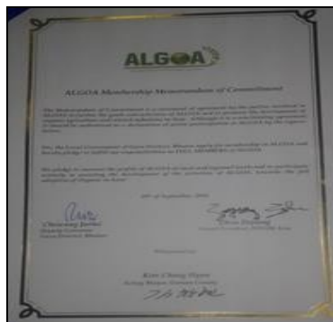
Memorandum of Commitment with ALGOA

On 18 November 2016 with support from of the Department of Agricultural Marketing and Cooperatives (DAMC) and Centenary Farmers' Market (CFM) management, a market promotion for certified organic potato was organised at the CFM during which 1735 kgs was sold.